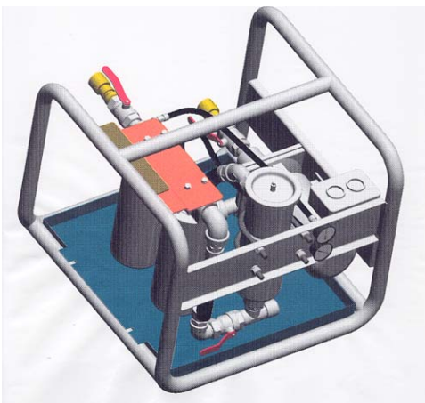
Industrial Hydraulic System 5 Micron Pump/Treat With Water Removal Pre-filters.

Licensed Professional Engineers: NY, NJ, PA, LA