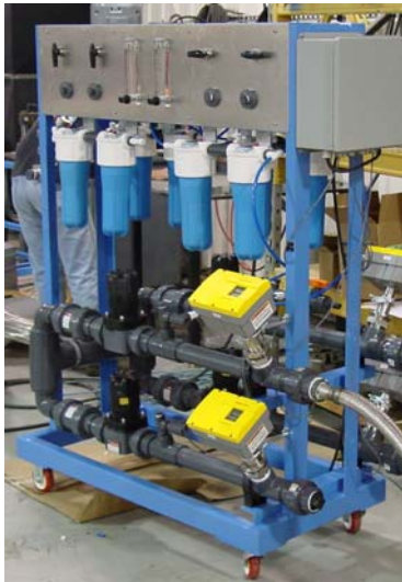
Filtration Evaluation Test System For U.S. NAVY Desalination Program.

EXPERIENCE: FILTRATION DEVICE AND MEDIA SELECTION FOR SOLID/LIQUID SEPARATION, FLOW ANALYSIS AND MODELING, INDUSTRIAL FILTRATION SYSTEMS, WATER TREATMENT SYSTEMS, FILTER COMPONENT DESIGN AND COMMERCIALIZATION, FILTER HOUSINGS ASME VIII