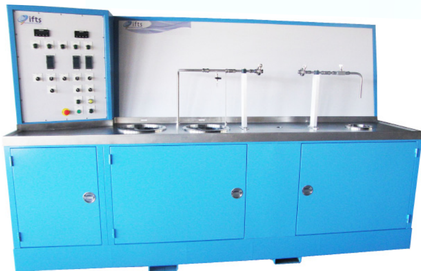
Custom developed fuel filter test stand in accordance with ISO 4020 standards

Experienced Filtration Engineers select better filtration separation solutions and understand process limitations.