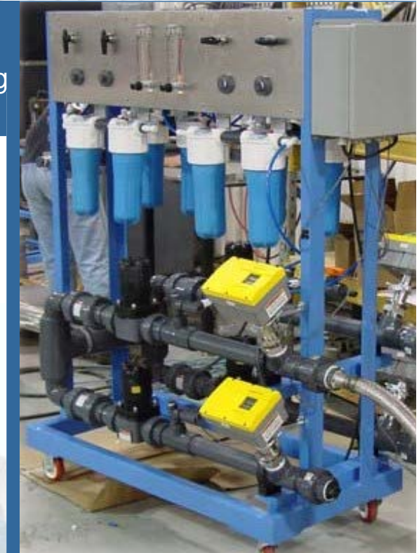
Filtration Evaluation Test System for U.S. NAVY Desalination Program

Advanced Design Tools and 3D visualization of fluid flow profiles uncover non-obvious, counter intuitive design flaws.