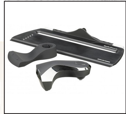
SPYDER 3 Display Calibration for Professional Photographers and Studios