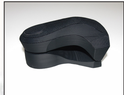
3D Rapid Prototype of Spyder 3 designed and made IN HOUSE at Sigma Design