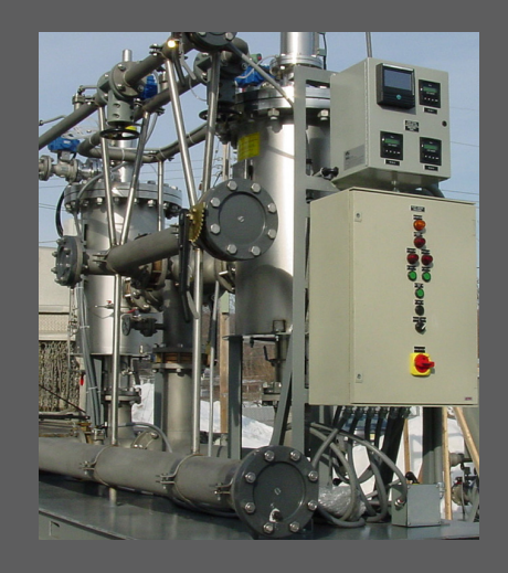
U.S. Navy seawater pump/filter process systems