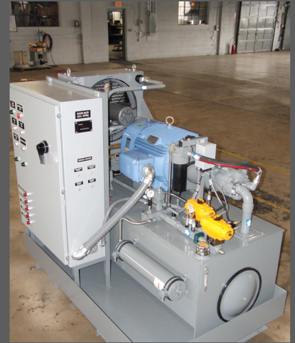
U.S. Navy Ordnance Hydraulic Power Unit