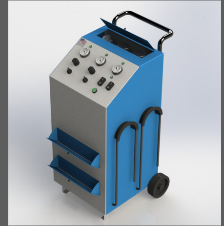
Engineering Analytical Test Device